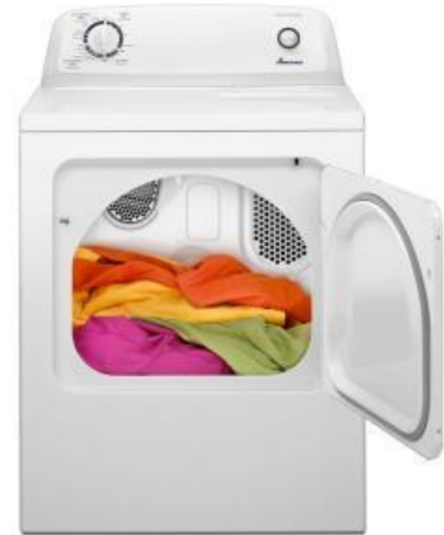
Frequent Hot Drying of Clothes & Bed Linens