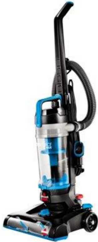
Bagless Vacuum Cleaner