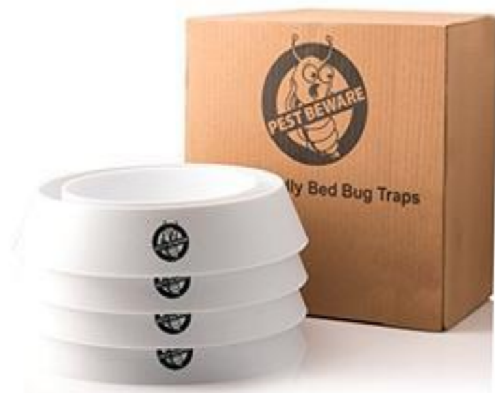
Climb up Bed Bug Traps

So people can sleep in their beds without being bitten