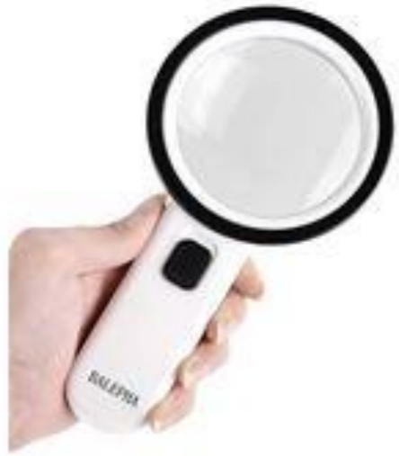
Magnifier with Light