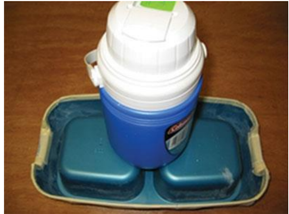
Do It Yourself