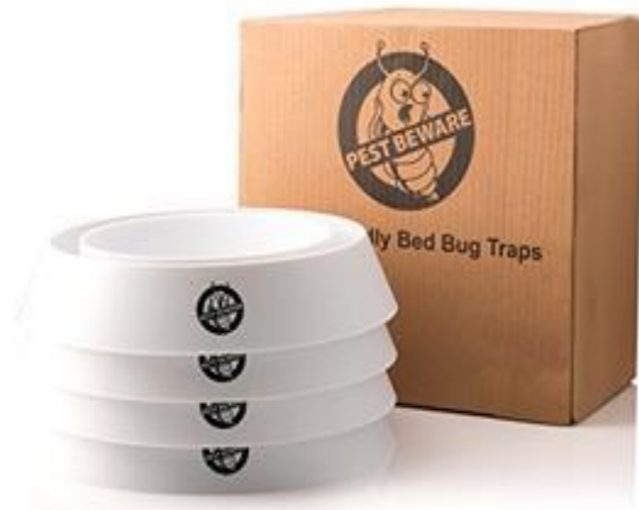
Climb up Bed Bug Traps

So people can sleep in their beds without being bitten